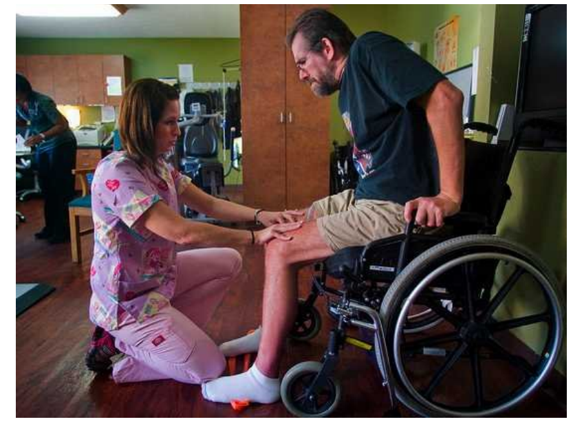
The I-News Network1

The ranking is based on data that weighted stress, physical